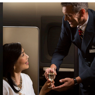
Haven of calm